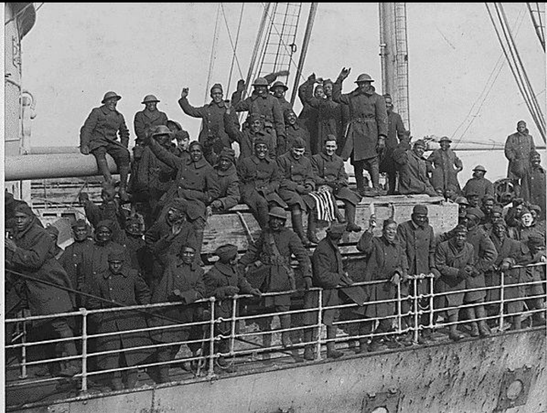
Soldiers of the New York Army National Guard's 369th Infantry Regiment (the Harlem Hellfighters) arrive back in New York Harbor February 12, 1919 after serving in France during World War I.

Black History Month is a celebration of the achievements of African Americans throughout our nation's history. It is the recognition that the Black experience is the American experience. It is the promise to embrace the fundamental ideals of American democracy—the belief that life, liberty and the pursuit of happiness can and should be afforded to all.