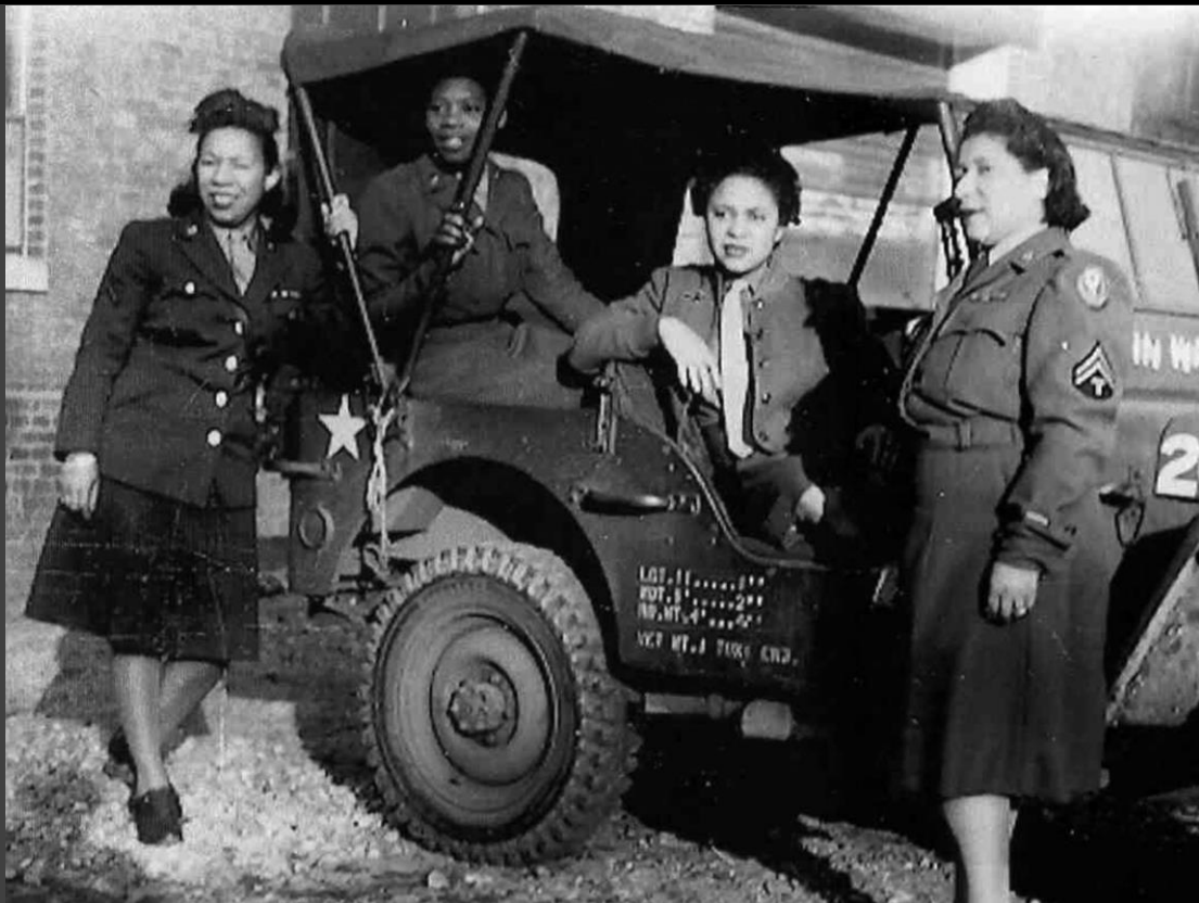
Members of the 6888th Central Postal Directory Battalion, the only all-African American, all-Female unit sent overseas during WWII.